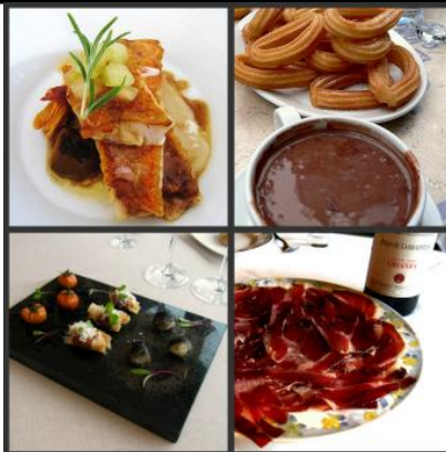
Marvelous cuisine using the freshest local ingredients & wonderful, lesser known Spanish wines

We are based in Cantabria, a complete travel destination and the heart of Green Spain.