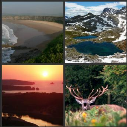
Throw snowballs and build sandcastles in a single day

Our extensive knowledge allows access to the true gems in the region that would otherwise be nearly impossible to find.