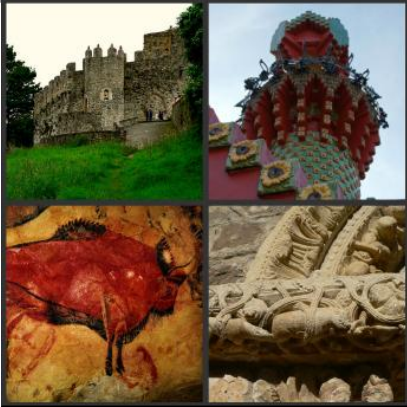
Historic sites spanning millennia 30,000 B.C. to medieval to modern

Northern Exposure Spain is about enjoying the things you love, taking pleasure in new experiences, and discovering a place you haven't heard of but won't soon forget.