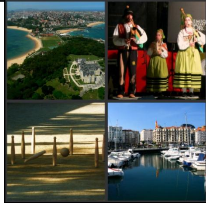
The vibrant seaside capital Santander and unique cultural traditions

Northern Exposure Spain is about enjoying the things you love, taking pleasure in new experiences, and discovering a place you haven't heard of but won't soon forget.